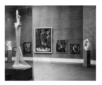
Große Berliner Kunstausstellung 1921, Blick in die Abteilung der Novembergruppe, Saal 27