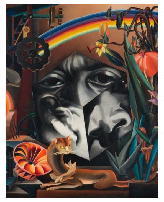
Hannah Höch, Cube (detail), 1926 Copyright: VG Bild-Kunst, Bonn 2018

Press conference: 07.11, 11 am, opening: 08.11, 7 pm, children's opening: 11.11, 3 pm–5 pm Admission: € 10 (concessions € 7); opening hours: Wed.-Mon. 10 am–6 pm