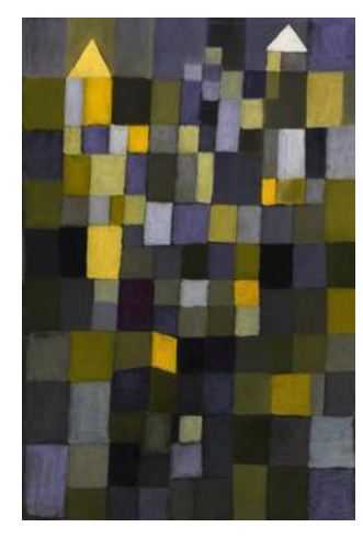
Paul Klee, Architektur, 1923