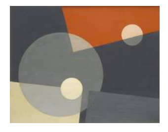
László Moholy-Nagy, am 7(26), 1926 <sup>©</sup> Urheberrechte am Werk erloschen