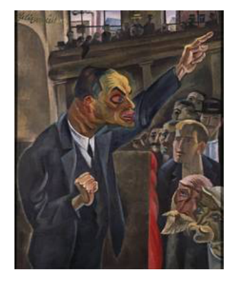
Conrad Felixmüller, Der Agitator, 1946, Neufassung des zerstörten Gemäldes von 1920