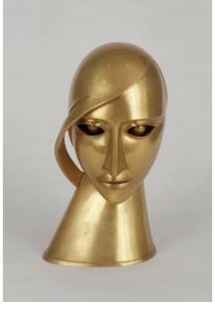
Rudolf Belling, Kopf in Messing (Toni Freeden), 1925