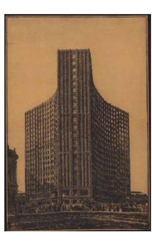
Hans Poelzig, Hochhaus am Bahnhof Friedrichstraße, Berlin, perspektivische Ansicht Standpunkt D, Lösung B, 1921 <sup>©</sup> Architekturmuseum TU Berlin, Inv. Nr. 2809