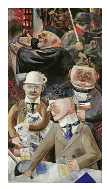
George Grosz, Stützen der Gesellschaft, 1926