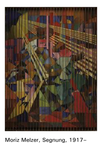
1922 <sup>©</sup> Moriz Melzer, Segliding, 1917– 1922