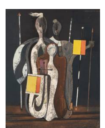
César Klein, Kreuz vor Barbaren, 1933