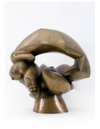
Rudolf Belling, Erotik, 1920