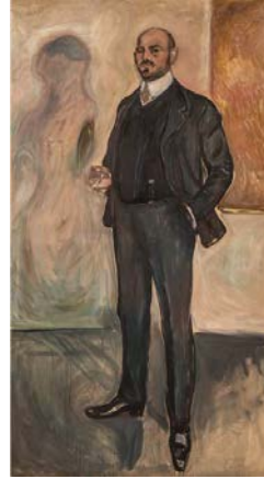
Edvard Munch, Portrait Walter Rathenau, Berlin, 1907