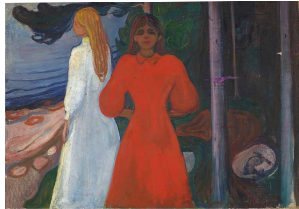
Edvard Munch, Rot und Weiß, 1899-1900