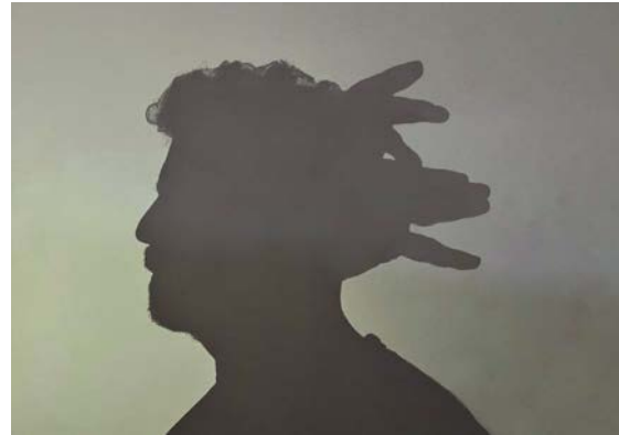
Nasan Tur, Shadow, 2023 © VG Bild-Kunst, Bonn 2023

Funded by the Senate Department for Culture and Europe.