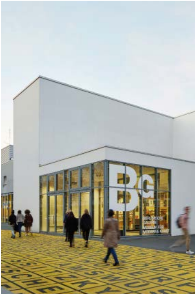
Berlinische Galerie, © Foto: Nosthe