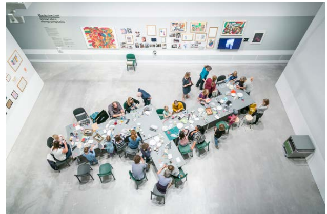
Berlinische Galerie, © Pascal Rohé

The project was critically accompanied by the network „Museen Queeren Berlin“ and was kindly supported by Schwules Museum.