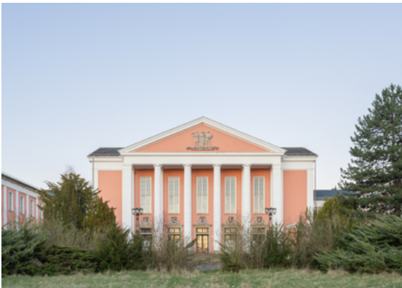
Schnep Renou, Kulturhaus Maxhütte, 2026, © Schnep Renou