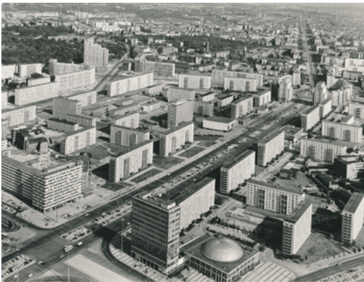
Rolf Vetter, Karl-Marx-Allee between Alexanderplatz and Strausberger Platz, 1970, © IRS Erkner, photo: Rolf Vetter