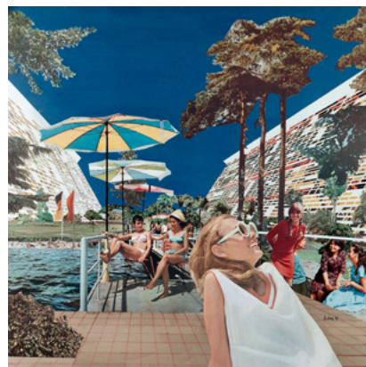
Dieter Urbach, Großhügelhaus, 1971, © Berlinische Galerie