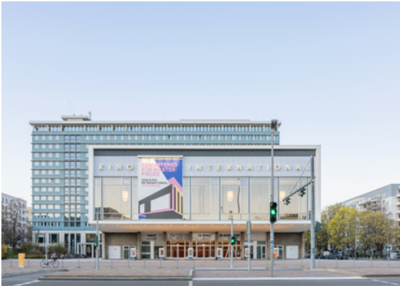
Schnep Renou, Kino International, 2026, © Schnep Renou