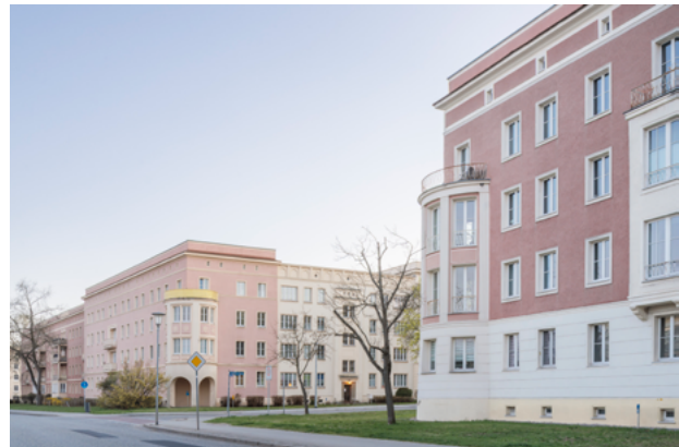
Schnep Renou, Eisenhüttenstadt, Residential Complex II, 2026, © Schnep Renou