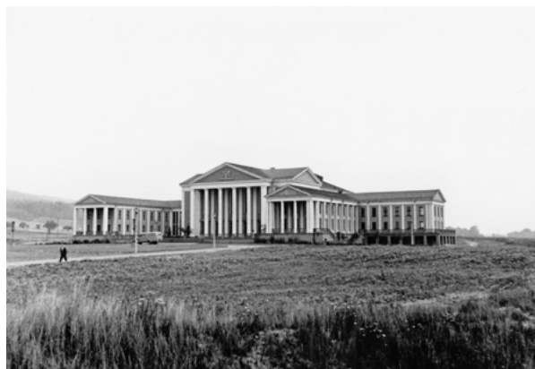
Kulturhaus Maxhütte, ca. 1955