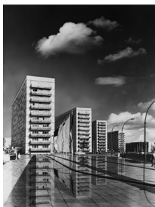
Dieter Urbach, The Prefabricated Buildings on Alexanderstraße, collage, ca. 1965