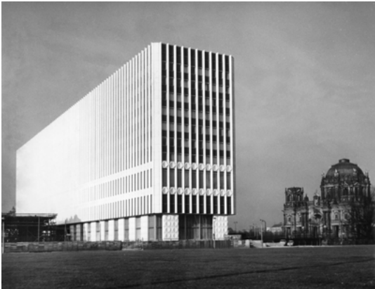
Lothar Willmann, Ministry of Foreign Affairs of the GDR, undated, © IRS Erkner, Lothar Willmann Collection