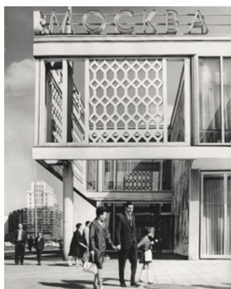
Restaurant Moskau with Strausberger Platz, ca. 1965