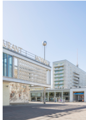
Schnep Renou, Café Moskau Pavillon, 2026