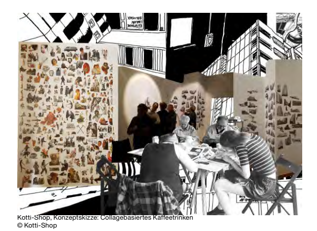
36 MONSTERS Kotti-Shop, Konzeptskizze: Urbanes Wohnzimmer