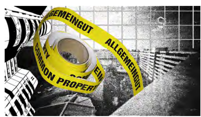
Kotti-Shop/SuperFuture, Collage © Stefan Endewardt