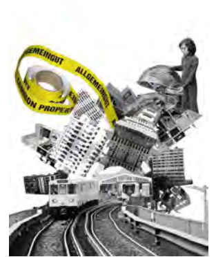
Kotti-Shop, Konzeptskizze: Kotti L'Amour © Kotti-Shop