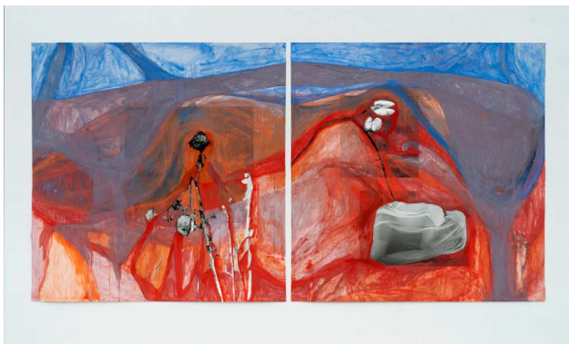
Özlem Altın, Grief, 2024, © Özlem Altın und THE PILL®