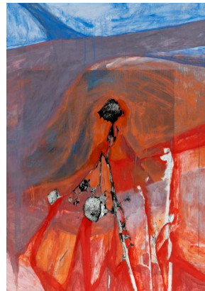
Özlem Altın, Grief, 2024, Detail, © Özlem Altın und THE PILL®, Foto: dotgain.info