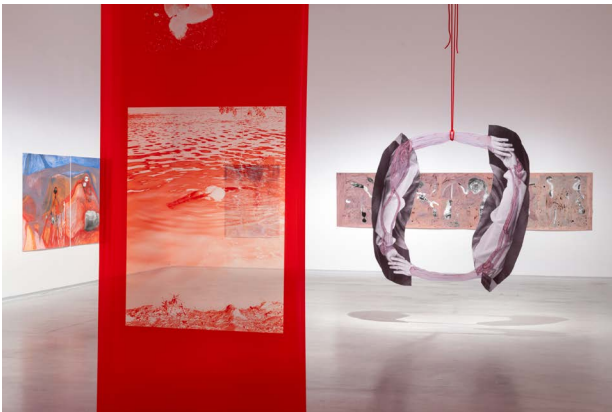
Installation view „Özlem Altın. Prisma.“, Berlinische Galerie, © dotgain.info