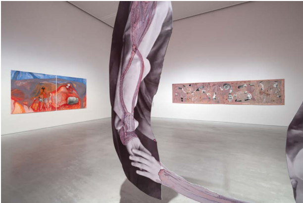
Installation view „Özlem Altın. Prisma.“, Berlinische Galerie, © dotgain.info