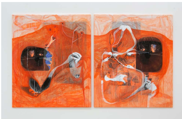
Özlem Altın, Naked Eye (landscape), 2023, © Özlem Altın und THE PILL®