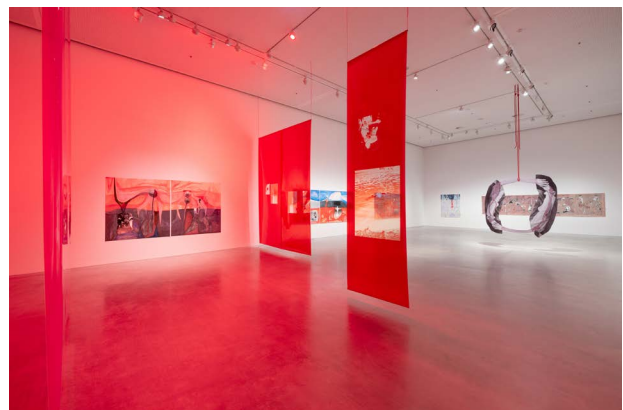
Installation view „Özlem Altın. Prisma.“, Berlinische Galerie, © dotgain.info