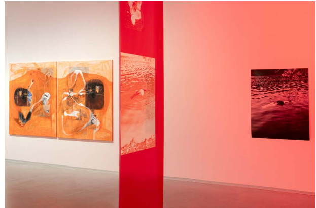
Installation view „Özlem Altın. Prisma.“, Berlinische Galerie, © dotgain.info