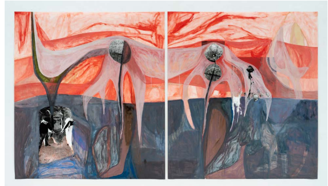
Özlem Altın, Teeth, Jaw, Anchor, 2024, © Özlem Altın und THE PILL®, Foto: dotgain.info