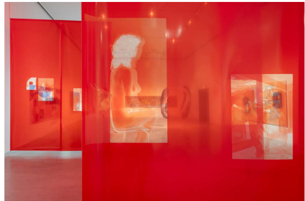
Installation view „Özlem Altın. Prisma.“, Berlinische Galerie, © dotgain.info