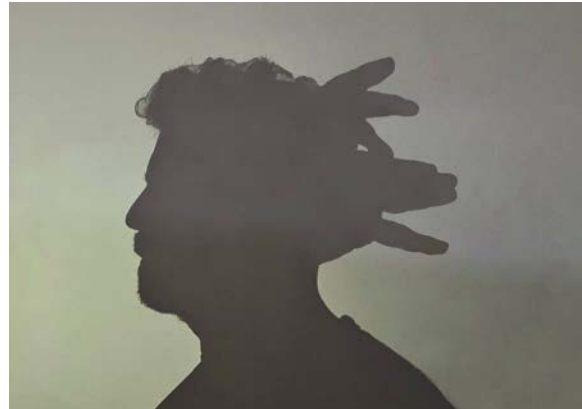
Nasan Tur, Shadow, 2023 © VG Bild-Kunst, Bonn 2023