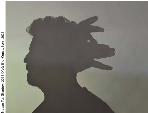
Nasan Tur, Shadow, 2023 © VG Bild-Kunst, Bonn 2023