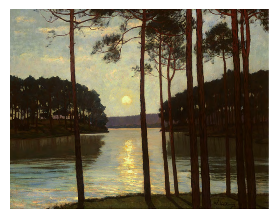
Walter Leistikow, Abendstimmung am Schlachtensee, um 1895