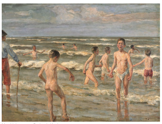
Max Liebermann, Badende Knaben, 1900