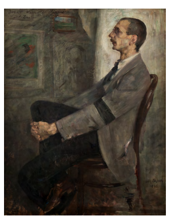
Lovis Corinth, Porträt Walter Leistikow, 1893