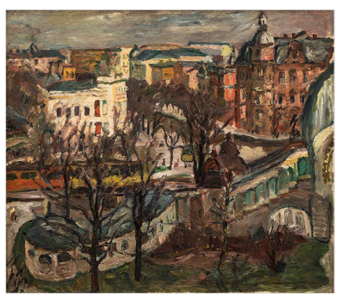
Max Beckmann, Nollendorfplatz, 1911