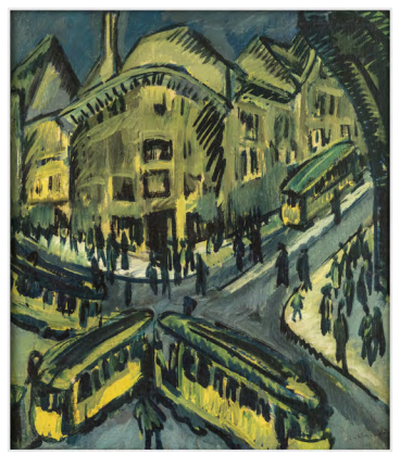
Ernst Ludwig Kirchner, Nollendorfplatz, 1912