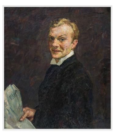
Max Beckmann, Selbstbildnis (lachend), 1910