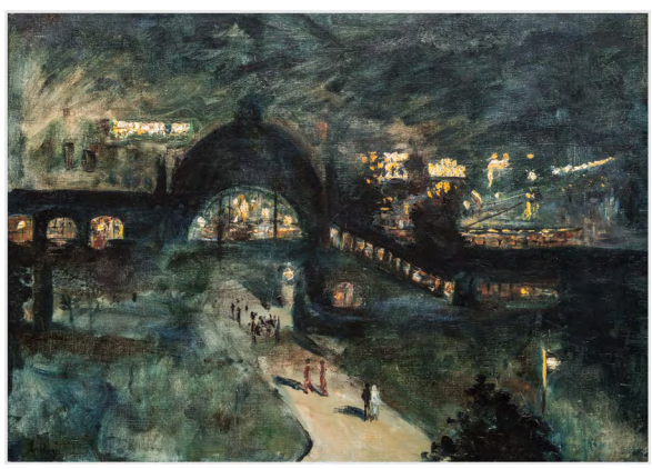
Lesser Ury, Bahnhof Nollendorfplatz bei Nacht, 1925