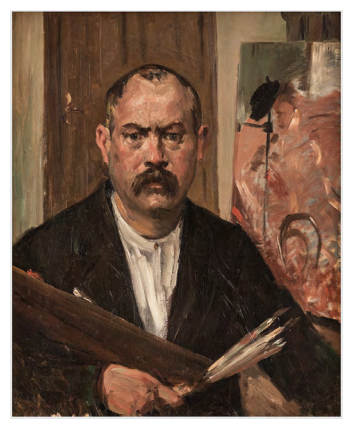
Lovis Corinth, Selbstbildnis, 1900