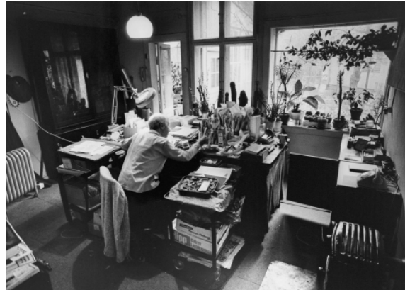
Stefan Moses, Ohne Titel (Hannah Höch in ihrem Haus in Berlin-Heiligensee), 1975, Berlinische Galerie

Mapping the Studio A changing landscape in Berlin