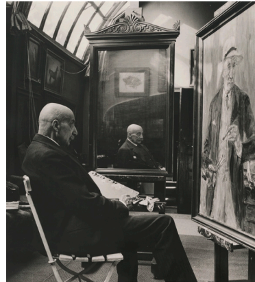
Fritz Eschen, Ohne Titel (Max Liebermann in seinem Atelier am Pariser Platz), um 1930, Berlinische Galerie