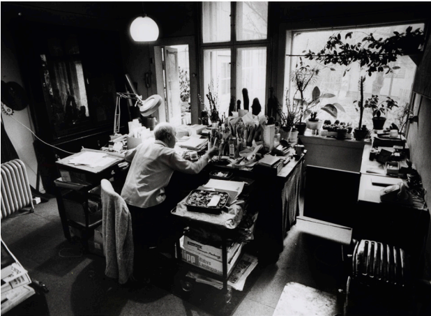
Stefan Moses, Ohne Titel (Hannah Höch in ihrem Haus in Berlin-Heiligensee), 1975