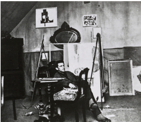
Ohne Titel (Iwan Puni in seinem Berliner Atelier), 1921, Berlinische Galerie