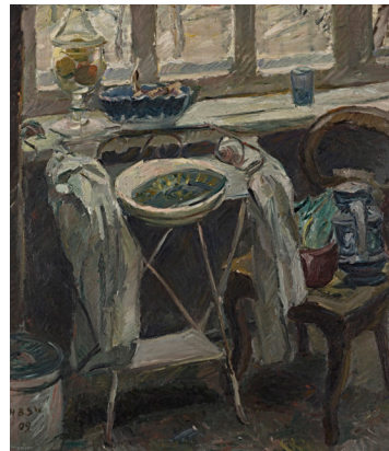
Max Beckmann, Stilleben mit Aussicht aus dem Atelier im Schnee, 1909, Ständige Leihgabe Privat-besitz, Haar, © Urheberrechte am Werk erloschen