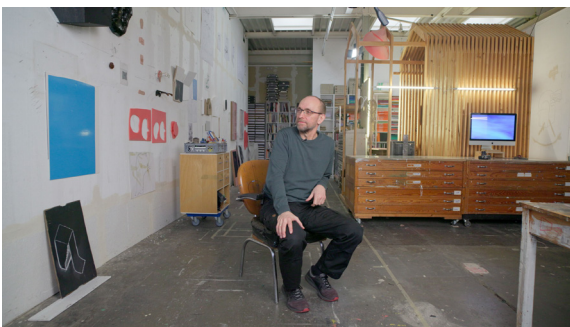
Heiner Franzen, Uferhallen, Berlin-Wedding, Film Still, 2023, © Berlinische Galerie Alle gezeigten Werke von Heiner Franzen, © Heiner Franzen