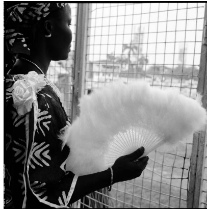
Akinbode Akinbiyi, Lagos Island, Lagos, 2001, © Akinbode Akinbiyi