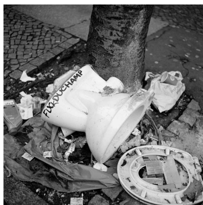
Akinbode Akinbiyi, Neukölln, Berlin, 2019, From the series: „Photography, Tobacco, Sweets, Condoms, and other Configurations“, since the 1970ies, © Akinbode Akinbiyi