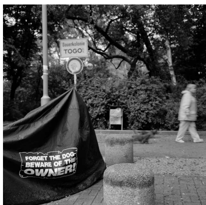
Akinbode Akinbiyi, Wedding, Berlin, 2005, From the series: „African Quarter“, since the 1990ies