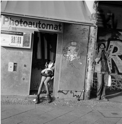
Akinbode Akinbiyi, Kreuzberg, Berlin, 2016, From the series: „Photography, Tobacco, Sweets, Condoms, and other Configurations“, since the 1970ies, © Akinbode Akinbiyi