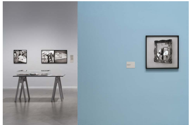
Installation view „Akinbode Akinbiyi. Being, Seeing, Wandering“