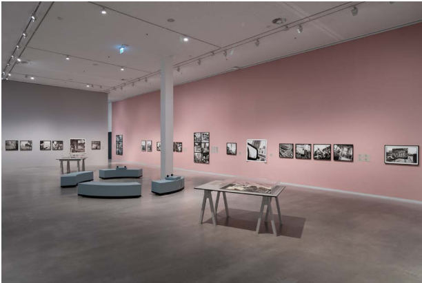
Installation view „Akinbode Akinbiyi. Being, Seeing, Wandering“