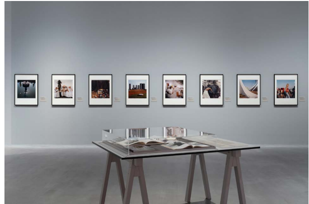
Installation view „Akinbode Akinbiyi. Being, Seeing, Wandering“, © Photo: dotgain.info