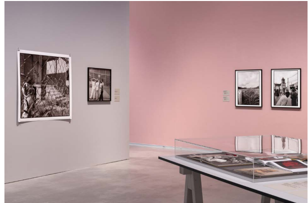
Installation view „Akinbode Akinbiyi. Being, Seeing, Wandering“