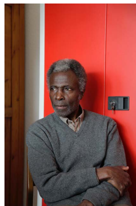
Akinbode Akinbiyi, Berlin, 2021