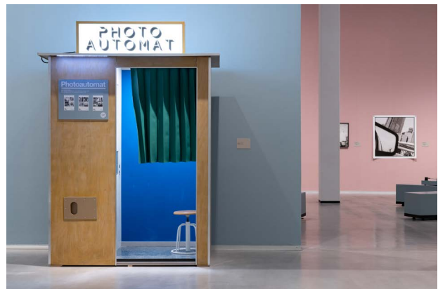
Installation view „Akinbode Akinbiyi. Being, Seeing, Wandering“, © Photo: dotgain.info