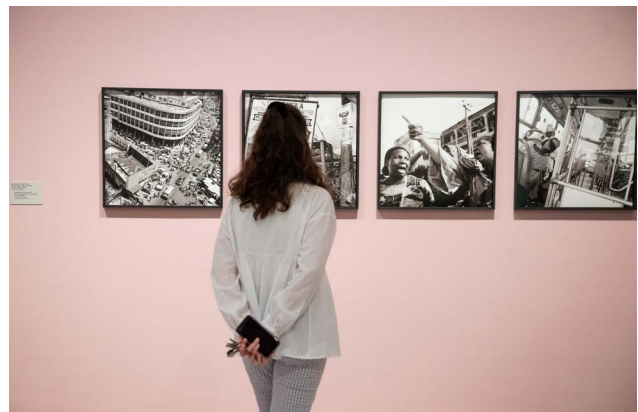
Installation view „Akinbode Akinbiyi. Being, Seeing, Wandering“