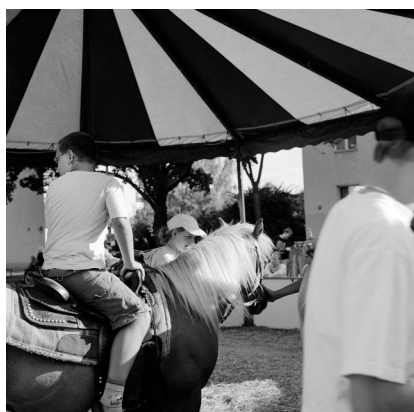
Akinbode Akinbiyi, Wedding, Berlin, 2005, From the series: „African Quarter“, since the 1990ies, © Akinbode Akinbiyi