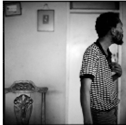
Akinbode Akinbiyi, Durban, 1993, From the series: „eThekwiní“