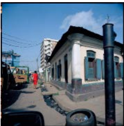
Akinbode Akinbiyi, Lafiagi, Lagos Island, Lagos, November 2002, From the series: „Black Spirituality“, © Akinbode Akinbiyi