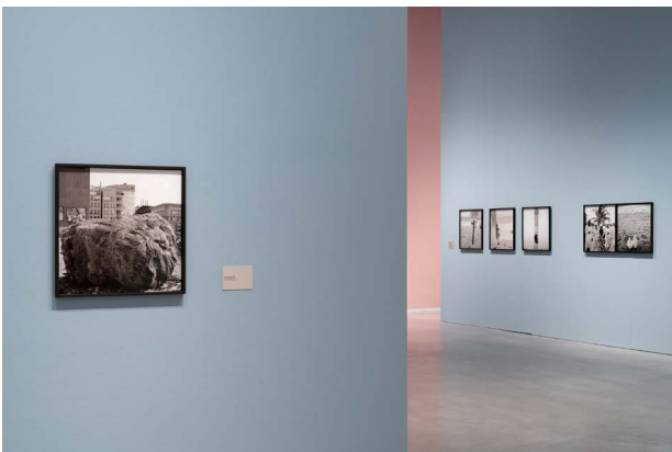
Installation view „Akinbode Akinbiyi. Being, Seeing, Wandering“