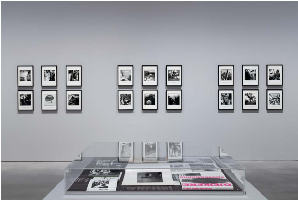
Installation view „Akinbode Akinbiyi. Being, Seeing, Wandering“, © Photo: dotgain.info