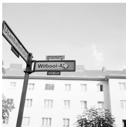
Akinbode Akinbiyi, Wedding, Berlin, 2005, From the series: „African Quarter“, since the 1990ies, © Akinbode Akinbiyi