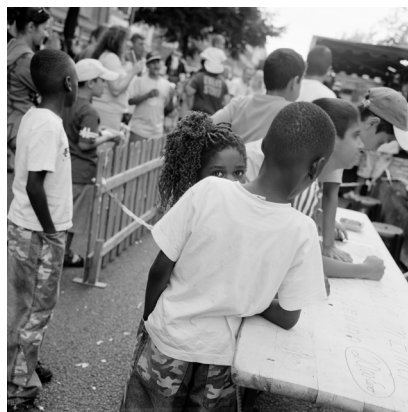
Akinbode Akinbiyi, Wedding, Berlin, 2005, From the series: „African Quarter“, since the 1990ies, © Akinbode Akinbiyi