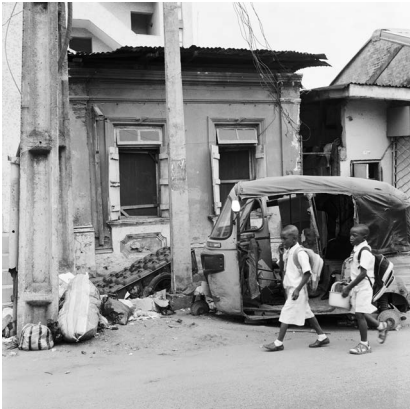
Akinbode Akinbiyi, Lagos Island, Lagos, 2016. From the series: „Lagos: All Roads“, since the 1980ies, © Akinbode Akinbiyi