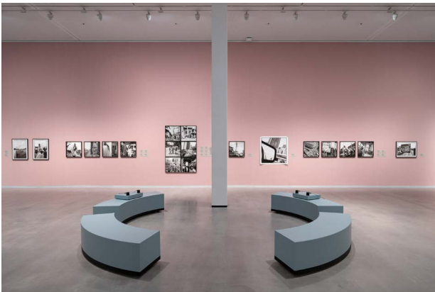
Installation view „Akinbode Akinbiyi. Being, Seeing, Wandering“, © Photo: dotgain.info