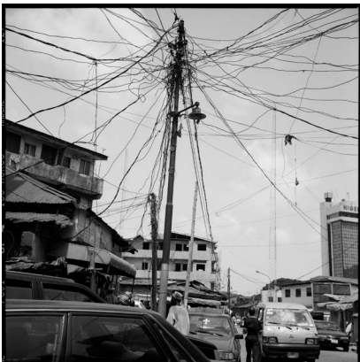
Akinbode Akinbiyi, Popo Aguada, Lagos Island, Lagos, 2006, From the series: „Lagos: All Roads“, since the 1980ies, © Akinbode Akinbiyi