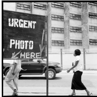
Akinbode Akinbiyi, Victoria Islands, Lagos, 2006, From the series: „Photography, Tobacco, Sweets, Condoms, and other Configurations“, since the 1970ies, © Akinbode Akinbiyi