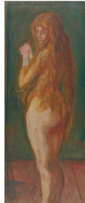
Edvard Munch, Nude with long Red Hair, 1902