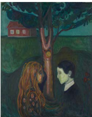
Edvard Munch, Eye in Eye, 1899–1900