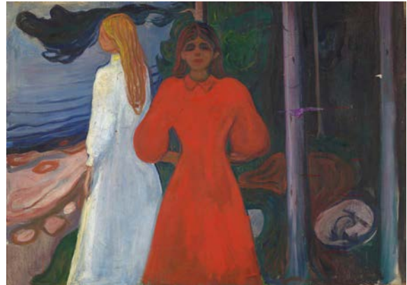
Edvard Munch, Red and White, 1899–1900