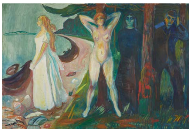
Edvard Munch, Woman, 1925