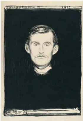
Edvard Munch, Self-Portrait, 1895