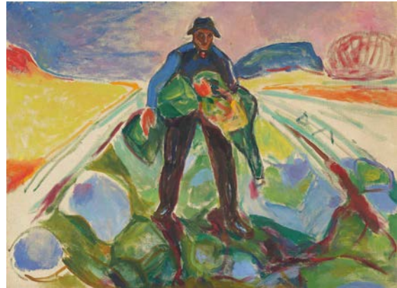
Edvard Munch, The Man in the Cabbage Field, 1943, Photo: © MUNCH, Oslo / Halvor Bjørngård