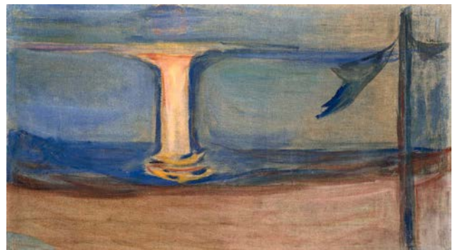
Edvard Munch, Moonlight on the Sea (The Reinhardt Frieze), 1906-1907