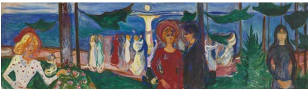
Edvard Munch, Dance on the Beach (The Linde Frieze), 1904