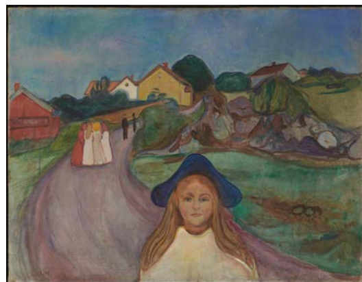
Edvard Munch, Road in Åsgårdstrand, 1901