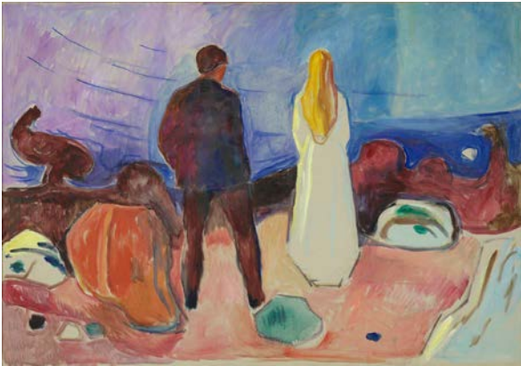
Edvard Munch, Two Human Beings (The Lonely Ones), ca 1935