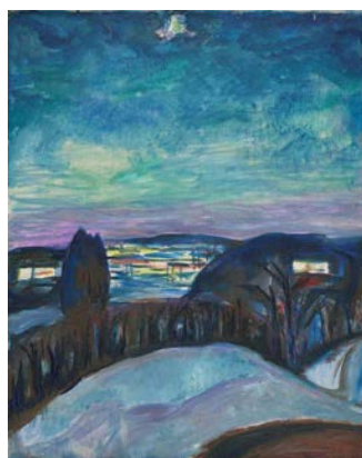
Edvard Munch, Starry Night, 1922-1924