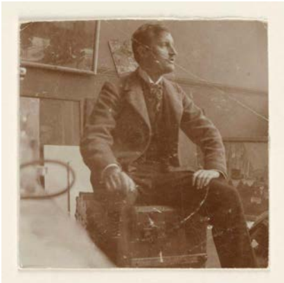
Edvard Munch, Self-Portrait on a Valise in the Studio, 1902