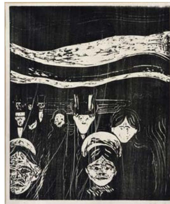
Edvard Munch, Angst, 1896