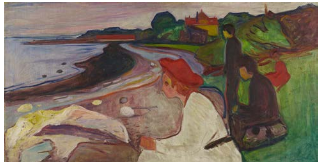
Edvard Munch, Young People on the Beach (The Linde Frieze), 1904