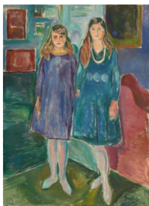
Edvard Munch, Two Teenagers, 1919