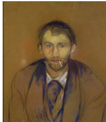
Edvard Munch, Stanislaw Przybyszewski, 1895