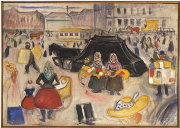
Edvard Munch, The Hearse on Potsdamer Platz, 1902