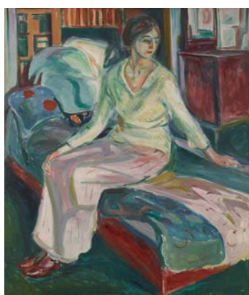
Edvard Munch, Seated Model on the Couch, 1924-26