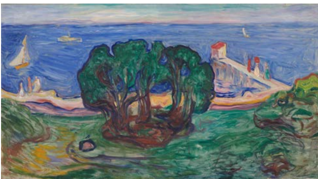
Edvard Munch, Trees by the Beach (The Linde Frieze), 1904