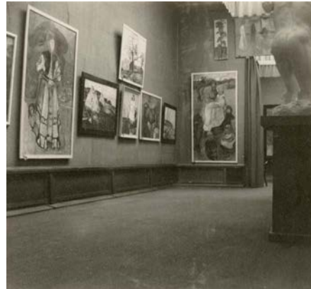
Edvard Munch's Exhibition at Paul Cassirer, 1907