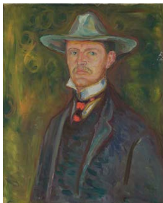
Edvard Munch, Self-Portrait in Broad Brimmed Hat, 1905-1906