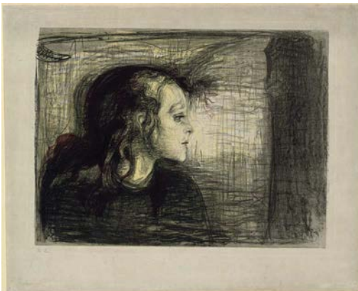
Edvard Munch, The Sick Child I, 1896