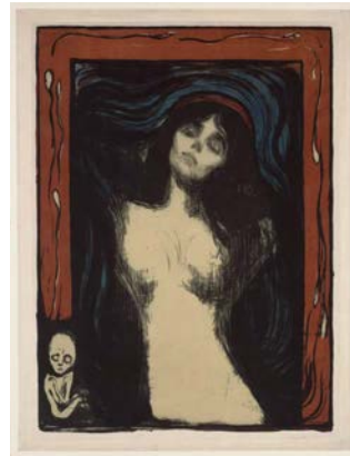
Edvard Munch, Madonna (Woman Making Love), 1895/1902