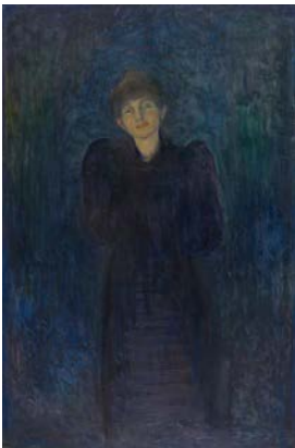
Edvard Munch, Dagny Juel Przybyszewska, 1893