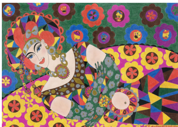
Tabea Blumenschein, Ohne Titel (Liegende Schönheit), 1991, Schenkung Ulrike Ottinger © Townes / Shoko Kawaida / Harald Blumenschein, Foto: Anja E. Witte