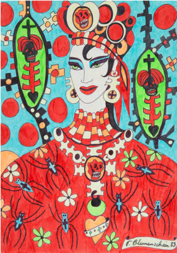
Tabea Blumenschein, Ohne Titel (Red Queen) , 1989, Schenkung Ulrike Ottinger © Townes / Shoko Kawaida / Harald Blumenschein, Foto: Kai-Annett Becker