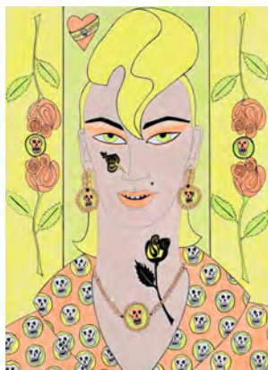
Tabea Blumenschein, Ohne Titel (Selbstportrait), 1988, Schenkung Ulrike Ottinger © Townes / Shoko Kawaida / Harald Blumenschein, Foto: Anja E. Witte