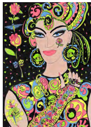
Tabea Blumenschein, Ohne Titel (Glow-in-the-Dark), 1988, Schenkung Ulrike Ottinger © Townes / Shoko Kawaida / Harald Blumenschein, Foto: Anja E. Witte