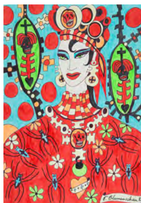
Tabea Blumenschein, Ohne Titel (Red Queen), 1989, Schenkung Ulrike Ottinger © Townes / Shoko Kawaida / Harald Blumenschein, Foto: Kai-Annett Becker